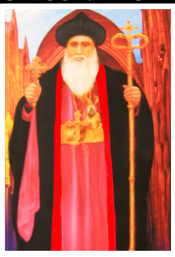
Saint Baselios Eldho